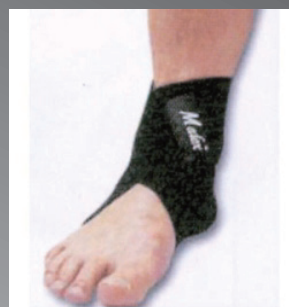
包紮式足踝護托 MD-A06 Ankle Wrap Support