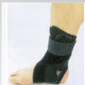
穩定性足踝護托 MD-A08 Ankle Stabilizer Support Brace