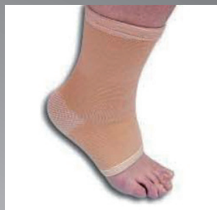
足踝護套 MD-A02 Ankle Sheath / Cover S碼 (>21cm) M碼 (21-23cm) L碼 (23-25)