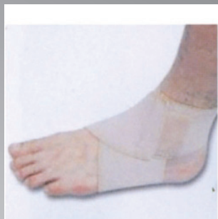
8字形足踝帶 MD-A04 Figure 8 Ankle Support